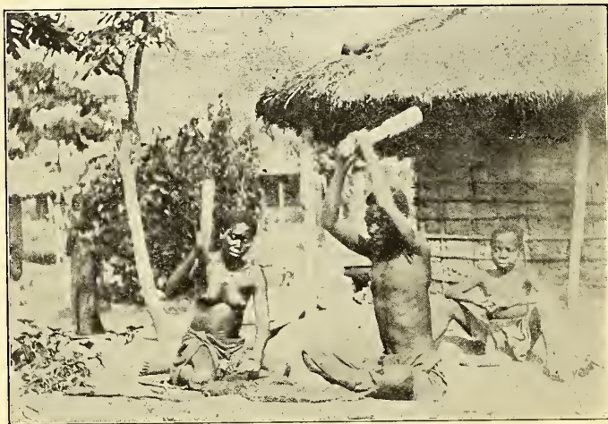
BEFORE THE COMING OF THE MISSIONARY

After giving a most graphic description of the moral and spiritual darkness that hangs like a cloud over the heathen world he tells of the wonderful transformation that has